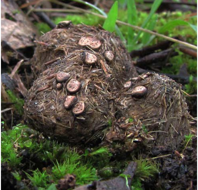
Small Dung Button (Poronia erici,)

Slime Moulds* have spore masses like fungi but they are in the Kingdom Protoctista. See <u>fungimap.org.au/about-fungi/2126-2/</u>