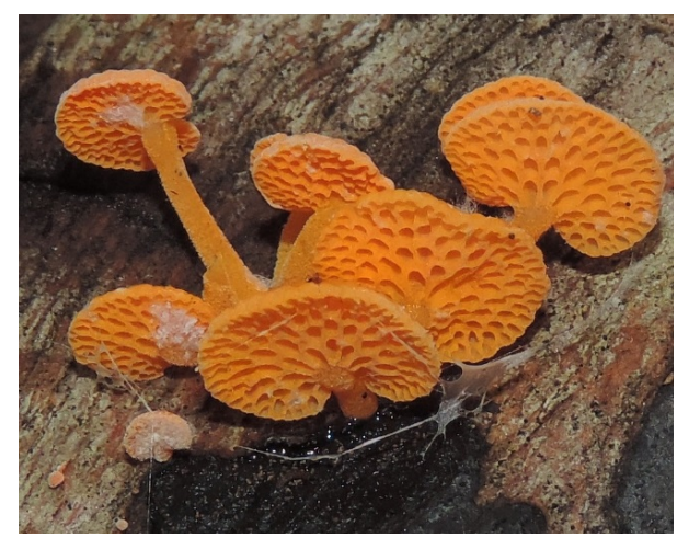
Orange Ping-pong Bats (Favolaschia calocera,)

This weedy mycorrhizal fungus came in with Pine trees. As well as partnering with many exotic trees it is a less useful partner to native Eucalypts and Myrtle Beech trees.