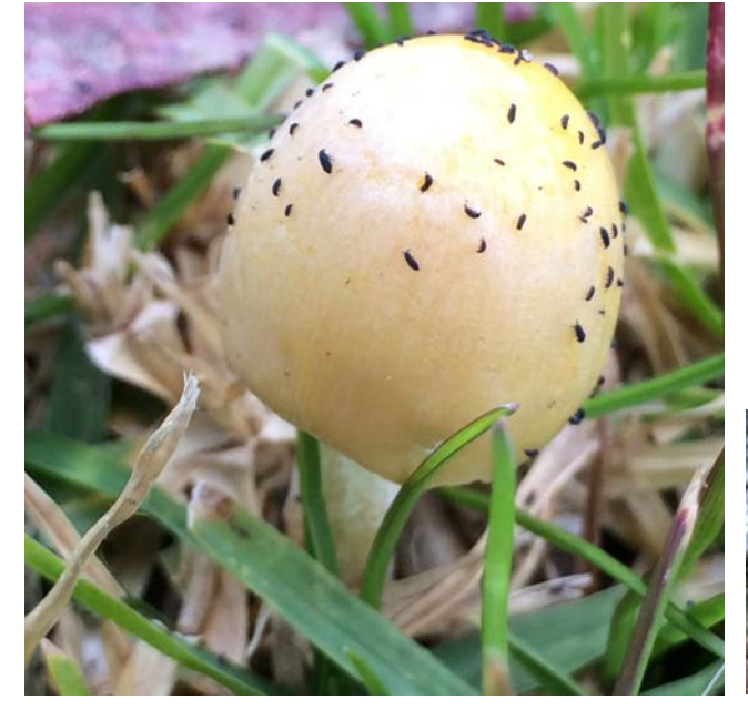
Yellow Fieldcap (Bolbitius titubans, SJM McMullan-Fisher)