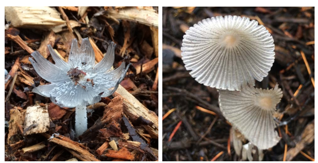
Hare's Foot Inkcap ( Coprinopsis lagopus , SJM McMullan-Fisher)