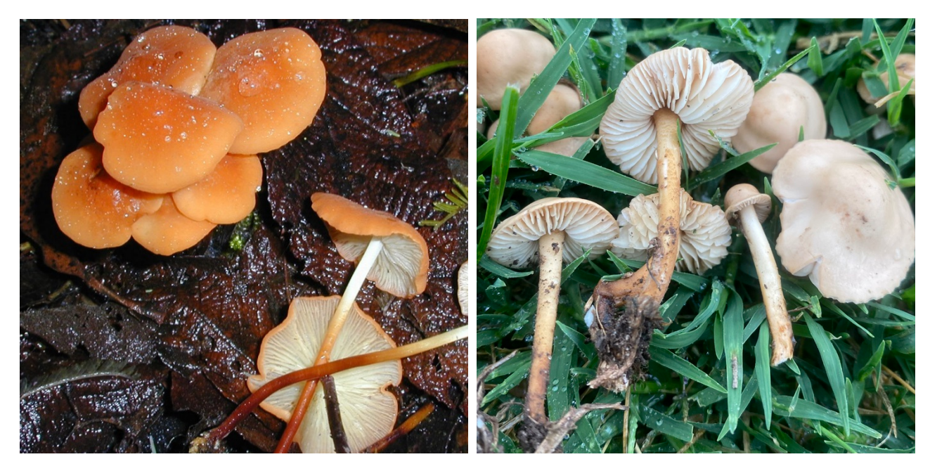
Velvet Parachute (Marasmius elegans,)