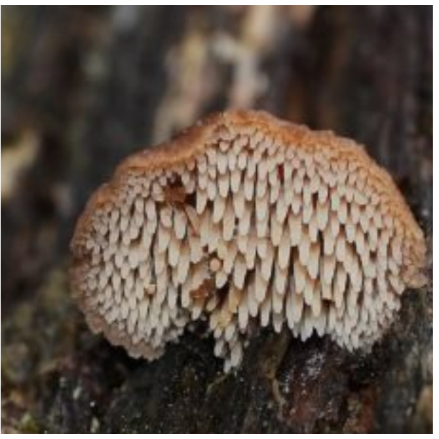
Stemless Earpick (Auriscalpium sp. 'Blackwood', Reiner Richter) – ENDANGERED