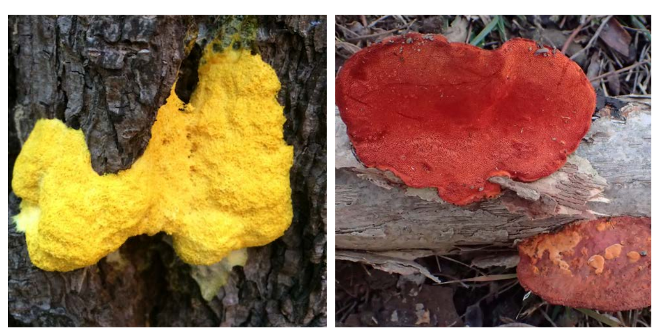
Dog vomit* (Fuligo septica, SJM McMullan-Fisher)