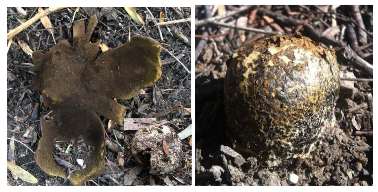
Giant Pasture Puffball (Mycenastrum corium, SJM McMullan-Fisher)