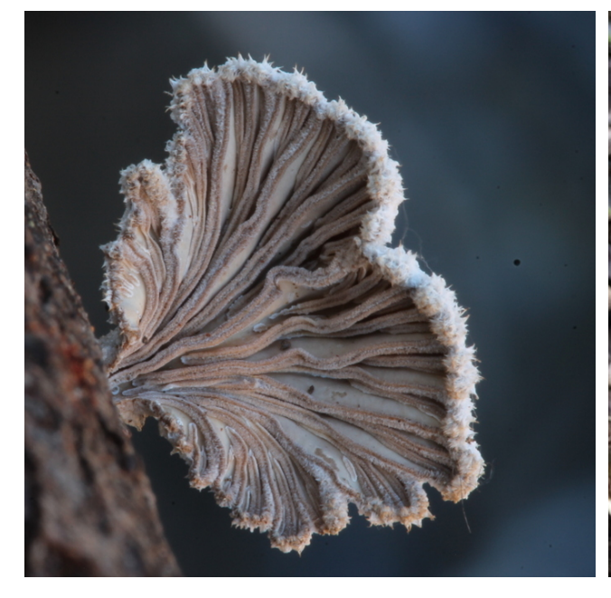
Spiltgill ( Schizophyllum commune, Eileen Laidlaw)