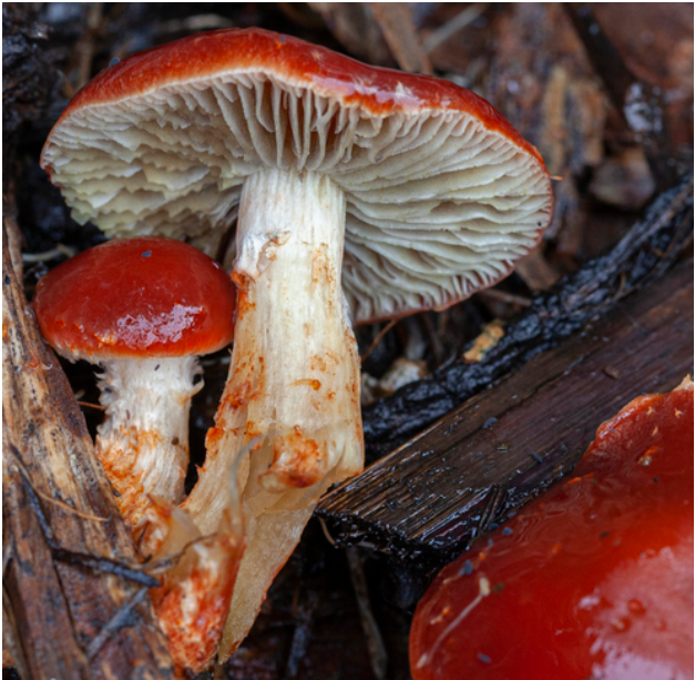
Chip Cherries (Leratiomyces ceres)