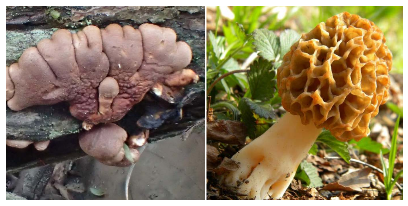
Tea-tree Fingers (Hypocreopsis amplectens, SJM McMullan-Fisher) – CRITICALLY ENDANGERED