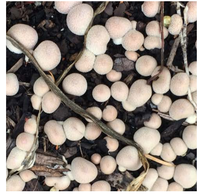
Wolf's milk* (Lycogala epidendrum, SJM McMullan-Fisher)