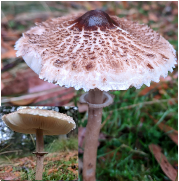
Graceful Parasol ( Macrolepiota clelandii , Ngaruru CC-BY-NC)