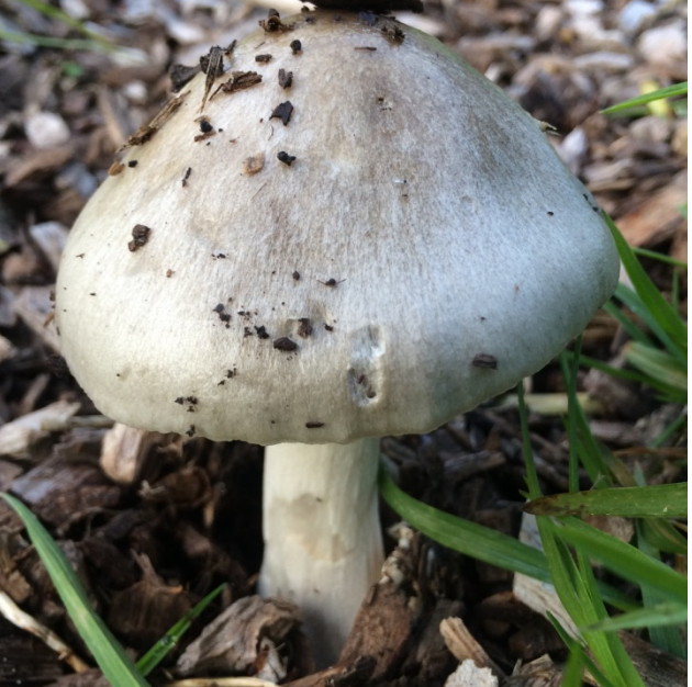
Stubble Rosegill (Volvopluteus gloiocephalus