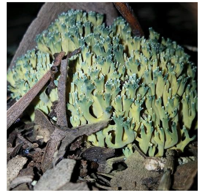
Green-staining Coral ( Phaeoclavulina abietina,) seen from Fawkner to Fitzroy.