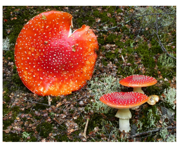
Fly Agaric (Amanita muscaria, Ian Bell)