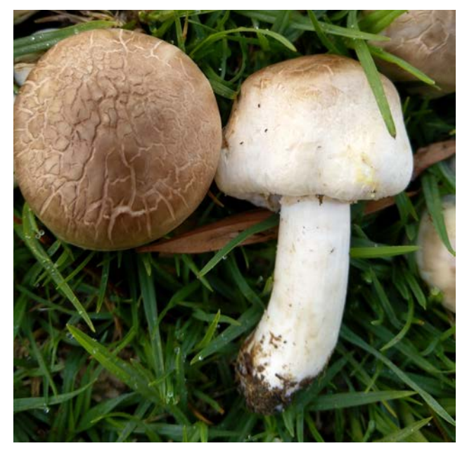
Yellow Stainer (Agaricus xanthodermus, SJM McMullan-Fisher)